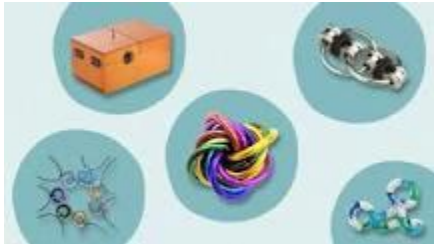
sample fidget toys.